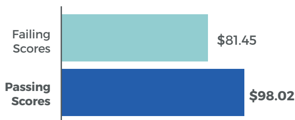
AVERAGE SALES PER HOUR

For an apparel retailer, employees who scored well on a pre-hire test earned 28% more than those who scored poorly.