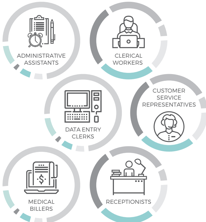
JOB PERFORMANCE BY CLIK RANKING